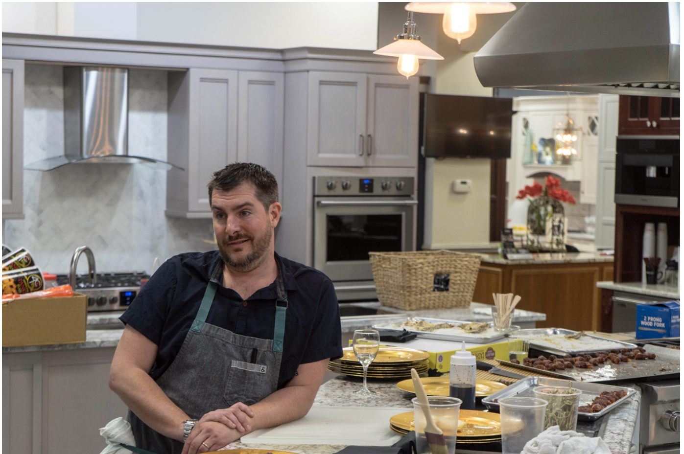
Harold Dieterle, the original winner of Bravo's Top Chef executing the menu at last year's "A Force for Families" fundraiser. This year, Harold will be on-hand as a distinguished guest.

The type of population Lodestar currently serves are those primarily afflicted with various forms of mental illness, such as those with severe social anxiety, various forms of psychosis, or who may be suicidal. While they do not currently focus on individuals with issues such as drug addiction or physical disabilities, at times those maladies are faced by their clients as well, and in those instances Lodestar does not shy away.