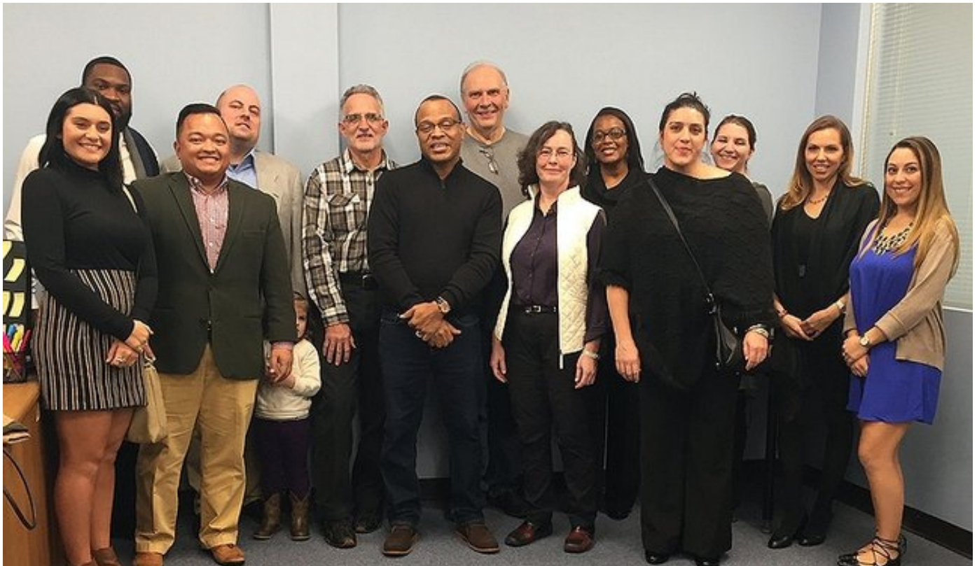
Lodestar's staff and Board of Directors.